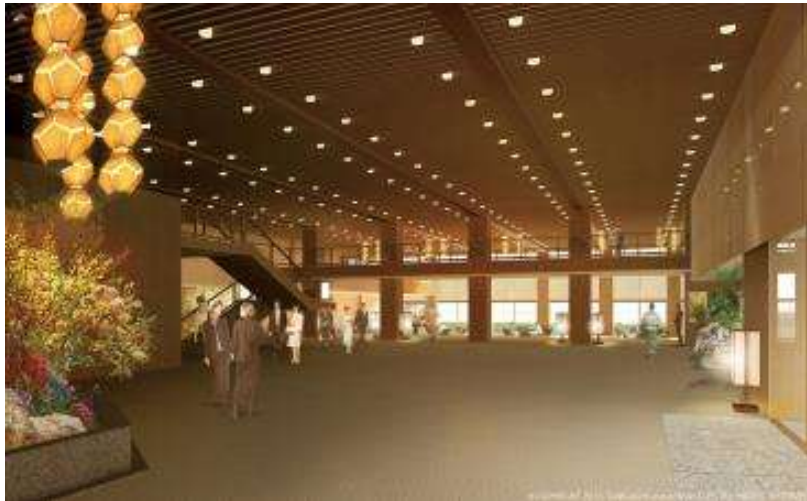
Rendition of Hotel Okura Tokyo's new main lobby

Decorations from the original facility that will grace the new lobby include the distinctive hexagonal Okura Lantern ceiling lights, lacquered tables and chairs arranged like plum flowers, world map and clock displaying global time zones, and the quietly elegant andon standing paper lamps.