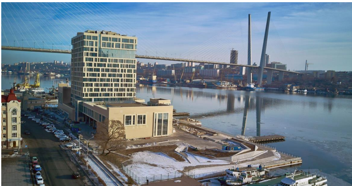
Hotel Okura Vladivostok

TOKYO, JAPAN, January 4, 2021 — Okura Nikko Hotel Management Co., Ltd. , a subsidiary of Hotel Okura Co., Ltd. , has announced it will open the Hotel Okura Vladivostok, the first Japanese-run hotel in the Russian Pacific port city, in the second half of 2021. Okura Nikko Hotel Management Co., Ltd. and Joint Stock Company «Mnogofunkcionalnii Gostinichnii Kompleks «Zolotoi Rog» signed an agreement covering the operation of the new property on December 29, 2020.